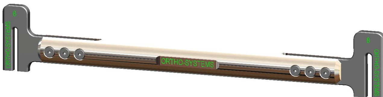
Hand Bending Iron- double